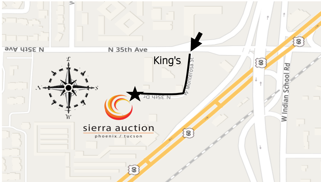
map copyright mapquest, additional details added